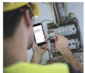
Electric Power Inspection