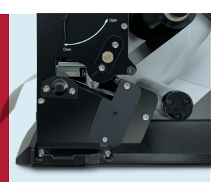
Fixed Metal Chassis Frame stable performance to handle heavy workloads